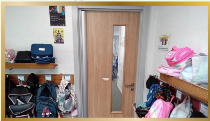
I will come in this door

This will be my classroom. It might look a little different in September.